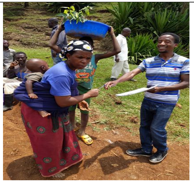
Farmers were given seedling and recorded.