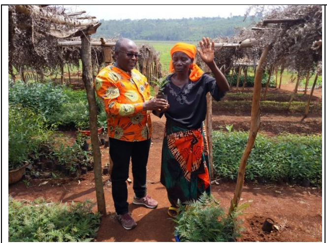
The opening of trees distribution in Nzahaha Sector by Nzahaha Social affairs officer