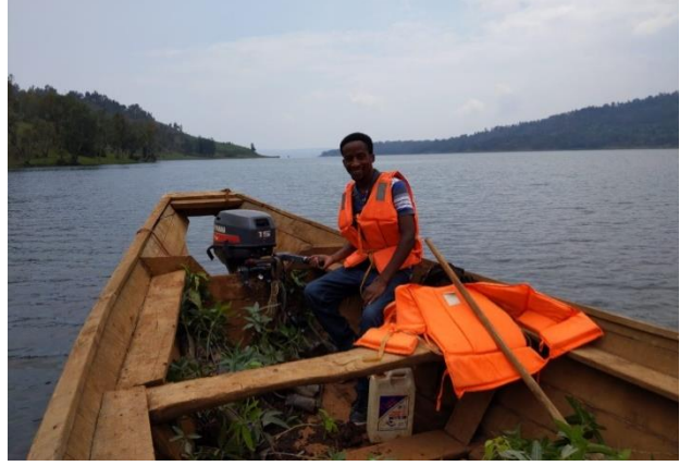
Nkombo sector in collaboration with RDIS was given seedling and transported and planted to Nkombo.