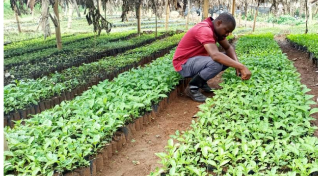
Bushenge agronomist in visit of Bushenge tree nursery.