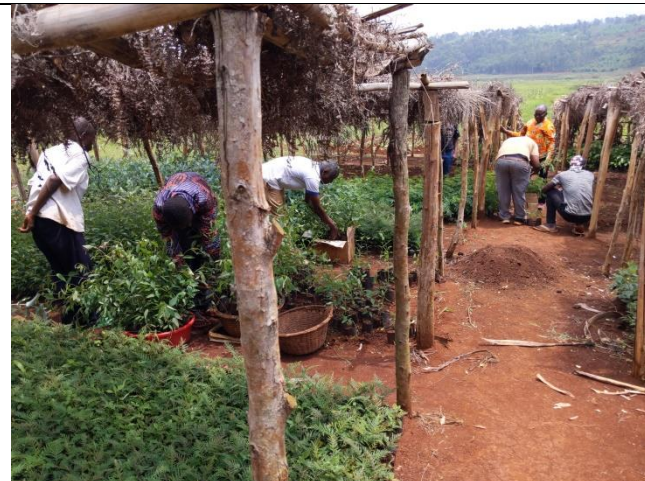
The Farmers were given trees on order.