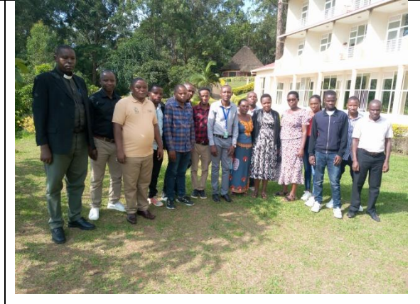
The below photos were taken during the training of Tree Nursery Bed Managers (Bed managers were also trained on Avocado and Mango fruits grafting)