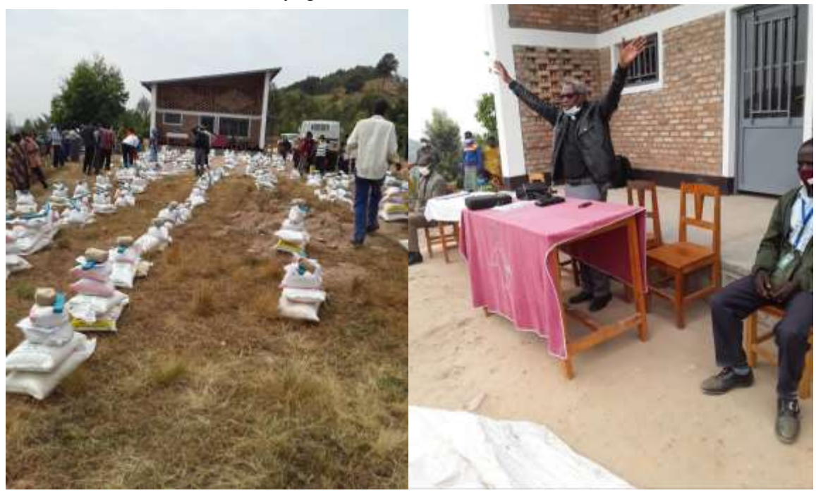
The distribution at Remera Parish In Kigeme Zone