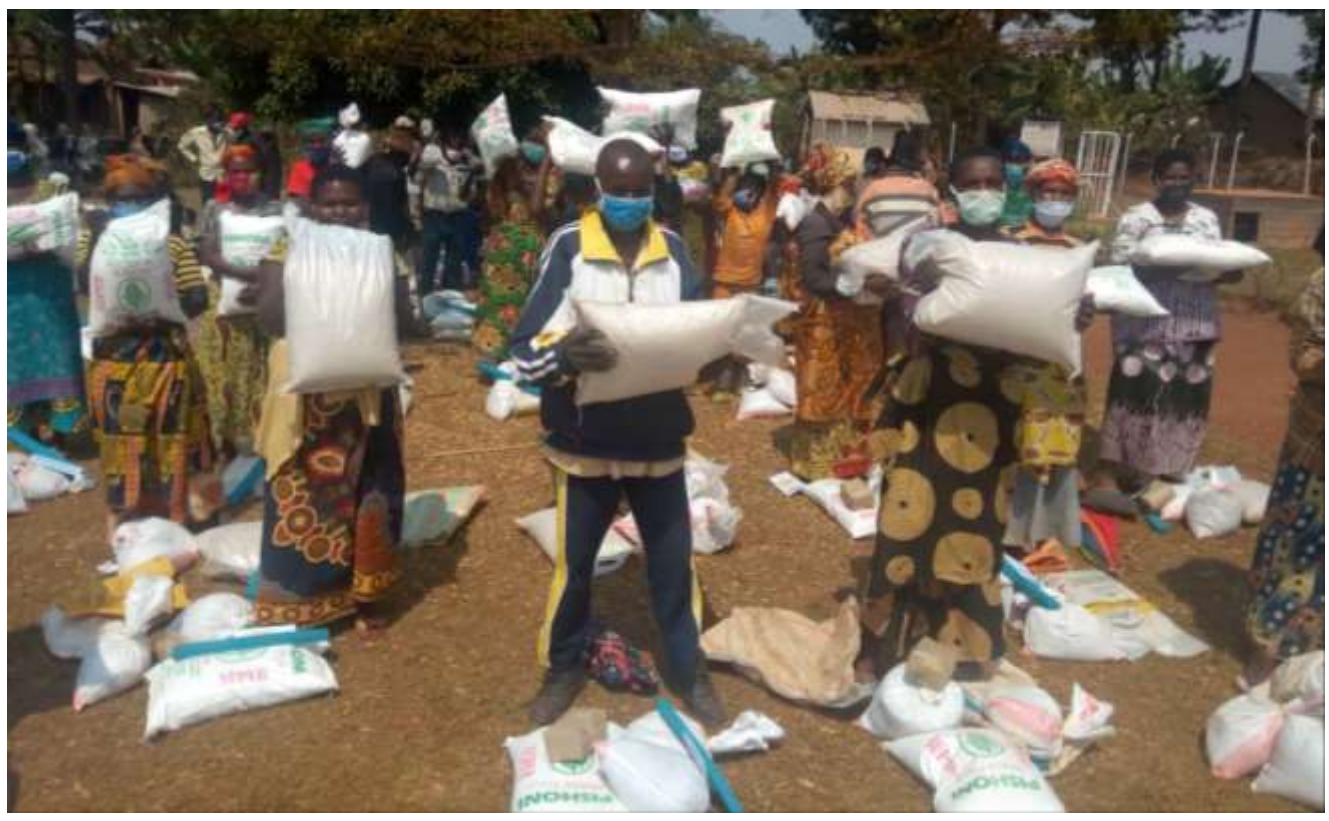
The above beneficiaries are from Gisagara district (Butare RDIS field Zone) after getting their package and they were thankful to RDIS and United Evangelical Mission to have to provide such helpful assistance.