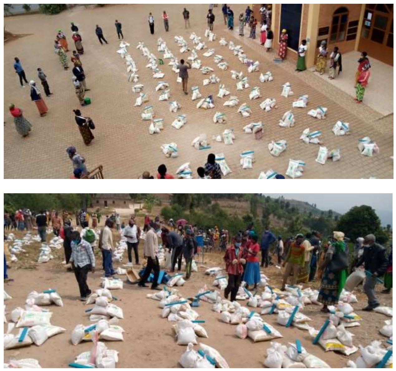
Mbazi sector in Kigeme zone August 20, 2020

In the distribution, the distribution team weared face mask showing the project funder and project Implementer which were looking as the photo below