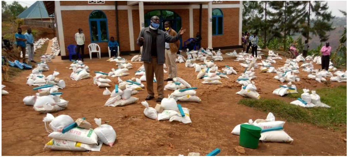
Distribution at Zion Parish /Shyogwe Diocese