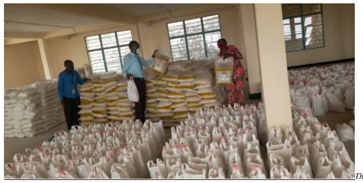
above Photo shows the store before the distribution