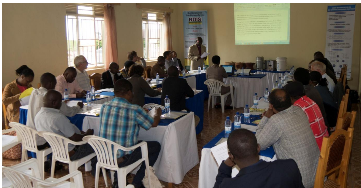
30/09/2016: Meeting of the Management of "ONE CLIMATE CLUB" and invited guests

He also added that, Mobisol offers a 3 year warranty, free customer care, maintenance and various payment options. Mobisol systems are available in four different sizes ranging from 80, 100, 120 to 200 W. The BASIC FAMILY PACKAGE starts at 399 rwf (about 0.50 USD) a day, featuring a solar home system, three LED light sets, one mobile charger and a torch, while the PREMIUM PACKAGE includes a 19" Solar television, two additional LED light sets and a solar radio.