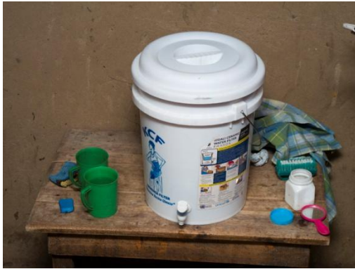
Ceramic Water Filters in the EAR Church Rwanda