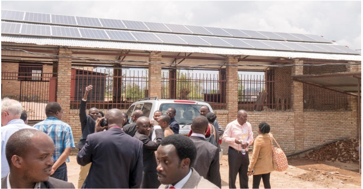
Solar PV installation at EAR Church in Shyogwe diocese

The introduction part was followed by the speech from the minister of Natural Resources, Honourable Dr Vincent Biruta, who in the first place commended the initiatives of Churches in looking for solutions against Climate Change.