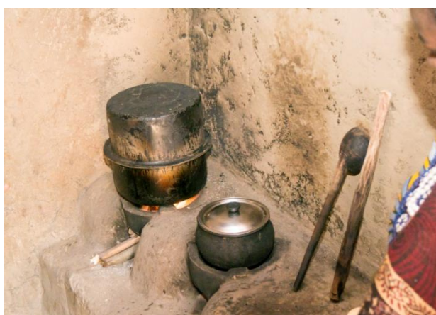
Energy Saving Stoves in the EAR Church Rwanda

In the view of the 1CC’s campaign, “if from 2020 onwards, every year 1% of the global GDP would be invested in sustainable energy, shared equitably between the Global North and the Global South, three goals could be achieved: (i) 100% renewable energies worldwide; (ii) 100% mitigation of human caused climate gases and (iii) 100% eradication of energy poverty.”