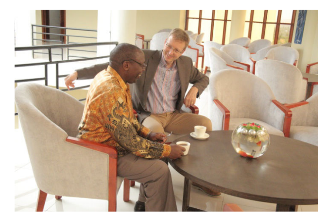
Participants in working groups