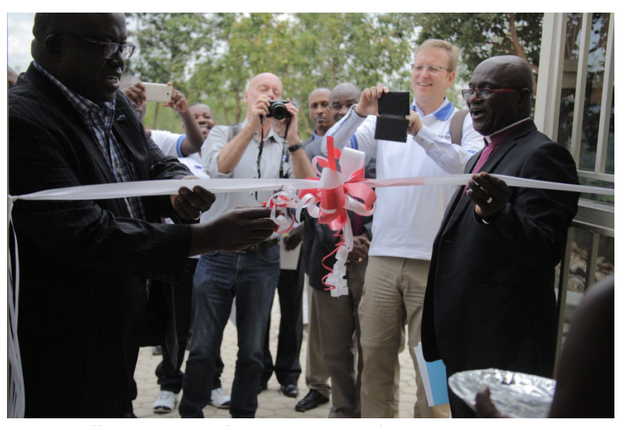
Official opening of Shyogwe Diocese's multipurpose hall

In the afternoon, the participants visited some beneficiaries in three groups. During the visitation of the users of stoves in their respective homes gave testimonies that the improved cook stoves have helped them to save money, to reduce smoke and that they spend shorter time for cooking compared to traditional three stones stoves. In addition, the beneficiaries are using Ceramic Water Filters, which are also distributed along with the improved stoves to purify drinking water without boiling. The Ceramic Water Filters are also helping the community members in the area to reduce water born diseases and consumption of firewood.