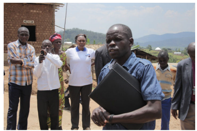
Head of the pottery cooperative addressing visitors