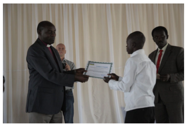
One of the best users is awarded with certificate

The exposure visit was concluded by a symbolic act of celebrating the stove project, whereby different speeches were delivered, just to mention a few, a speech was delivered by a representative of the mayor of local government, the representatives from UEM and the representative of the Anglican Church in Rwanda. The colourful event was accompanied by performances of traditional songs and dances by a local group. Furthermore, certificates were given to the stove best users and a stove was lit by Rev. Dr. Jochen Motte from UEM to symbolise the successful continuation of the stove project.