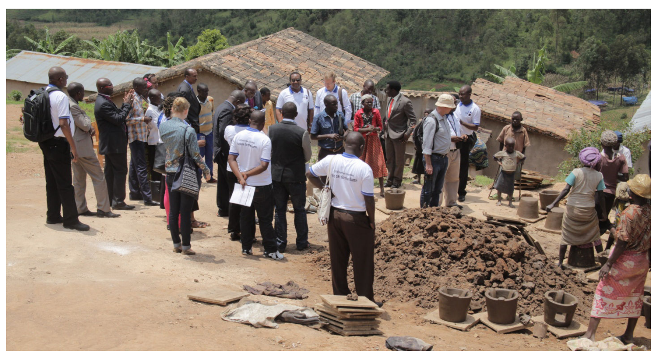
Exposure visit to RDIS's Stove project – Pottery cooperative