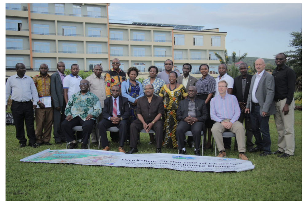
Group picture of participants on the grounds of the Golden Tulip La Palisse Kigali in Nyamata, Rwanda

After the presentation and fruitful discussions on this philosophical topic, the participants went into final working groups to deal with the question of how UEM member Churches should continue to address Climate and environmental challenges as well as the continuation of Climate Protection Programme. The findings and recommendations of the groups were presented and discussed by all participants in plenary, followed by a session of summing up of the findings and formulation of conclusion, commitments and follow up plan.